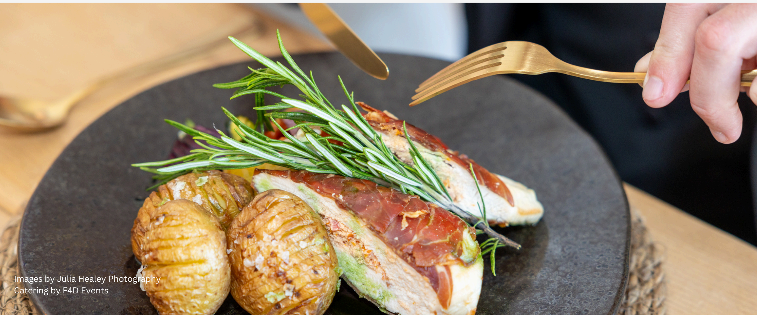
Catering by F4D Events